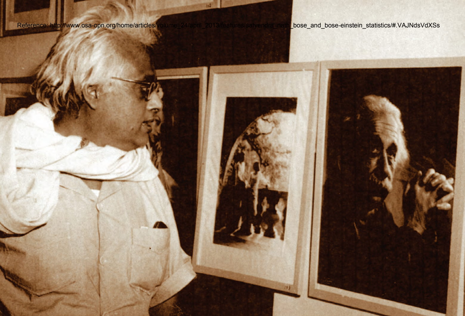
S.N. Bose viewing a photo of Albert Einstein (1953).